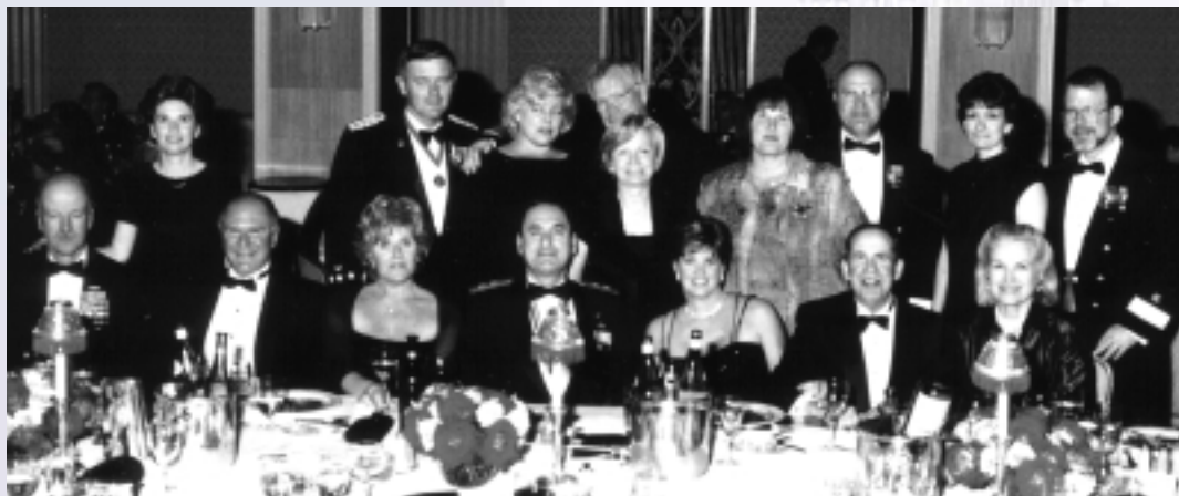
DISTINGUISHED AND HONORED GUESTS TABLE