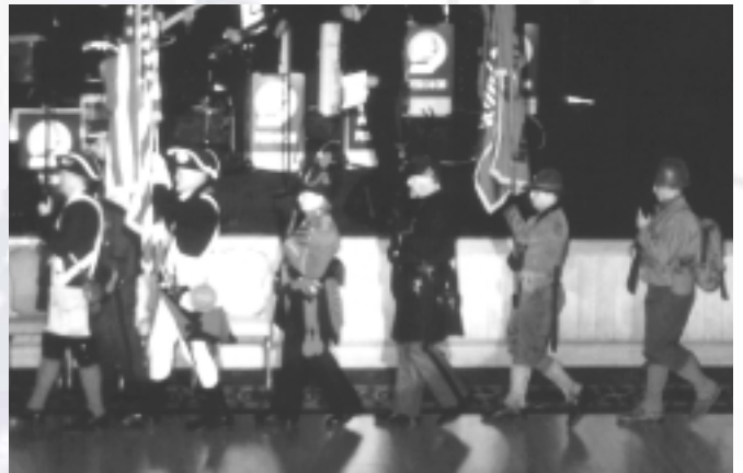
THE COLOR GUARD