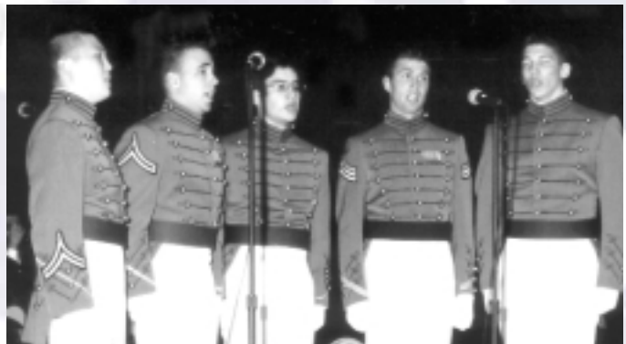
MEMBERS OF THE WEST POINT GLEE CLUB