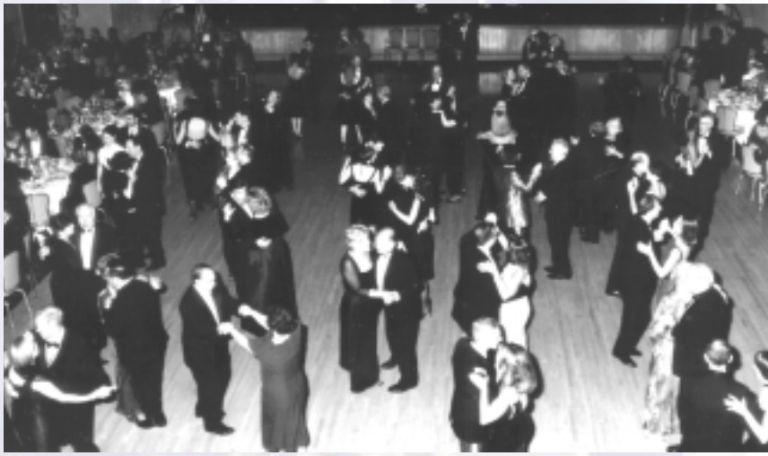
GRAND BALLROOM, WALDORF-ASTORIA—NOVEMBER 4, 2000