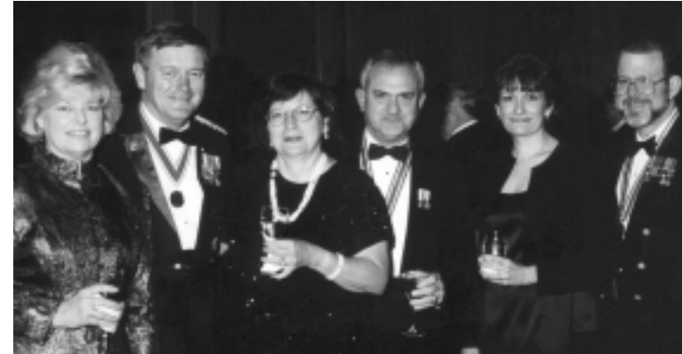
Honored guests and their wives